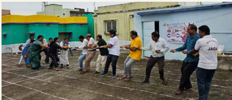
A view of National Sports Day Celebration at RRI (H), Puri