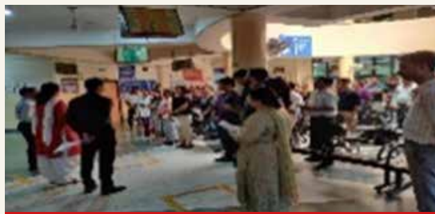
A view of Pledge on Meri Maati Mera Desh taken by Officers and staff of DDPRCRI(H), Noida

Noida: Meri Maati Mera Desh Campaign Organised by Dr. D P Rastogi Central Research Institute for Homoeopathy, Noida on 26 th August 2023 at the institute. The Officers and staff of Dr. D P Rastogi Central Research Institute for Homoeopathy, Noida took a pledge on Meri Maati Mera Desh under 'Azadi ka Amrit Mahotsav' on 26 th August 2023. It was a tribute to the Veers and Veeranganas who have made the supreme sacrifice for the country and pledged to make India developed and self reliant by 2047, to remove any trace of colonial mindset, to celebrate our heritage, to strengthen unity and respect those who protect the country and to perform the duties of a citizen.