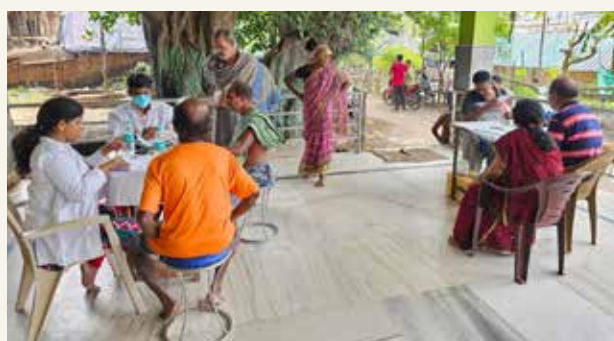
Free Health Camp at Beldal village, Puri by RRI(H), Puri

Puri: On 3 rd September 2023, a free health camp was conducted at Beldal village, Puri on the occasion of the birthday of Late Debendra Kumar Das, Donor of G. B. Road Building, Regional Research Institute (H), Puri.