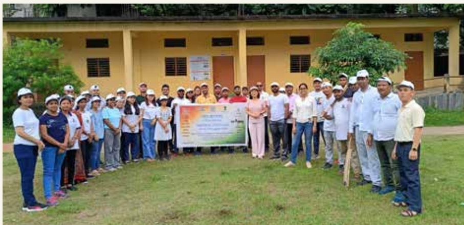
A view of National Sports Day Celebration at RRI(H), Guwahati