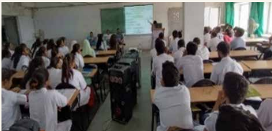
A view of Training Cum Orientation Workshop for Drug Proving Research and Awareness about the HPT Portal of CCRH

research trial. He, along with the faculty were informed to constitute an Institutional Ethics Committee and also a Drug proving Research Committee in the college. The roles and responsibilities of the Committee and support from the Council was also communicated. This program was indeed successful with participation of more than 150 students and 20 faculty of the college.