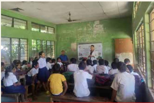
A view of Rashtriya Poshan Maah Conducted by Regional Research Institute for Homoeopathy, Guwahati

Guwahati: Rashtriya Poshan Maah Conducted by Regional Research Institute for Homoeopathy, Guwahati from 1 st to 30 th September 2023 at the institute. Following activities were undertaken as per the identified themes like Awareness session on health dietary practices, Awareness campaign on lifestyle on role of millets, Awareness session on breastfeeding and complementary feeding, Sensitisation activity promoting AYUSH lifestyle practices for health promotion, Session on role of Ayush to address Anemia, Awareness session on the role of traditional and regional nutritious food health promotion where different activities were conducted by doctors at OPD, RRI(H), Guwahati, Camps, nearby schools.