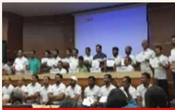
A view of award giving ceremony during National Sports Day celebration at CCRH Headquarters, New Delhi

Jaipur: A National Sports Day 2023 was celebrated at Central Research Institute for Homoeopathy, Jaipur on 29 th August 2023 by all the officials and staff members and Fit India Pledge was taken on the same day. Several outdoor/indoor fun activities were planned for this day.