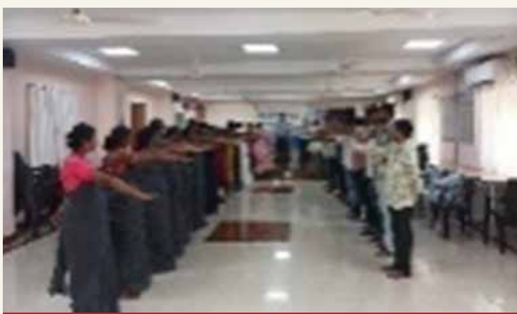
A view of pledge taking Ceremony at Regional Research Institute for Homoeopathy, Gudivada