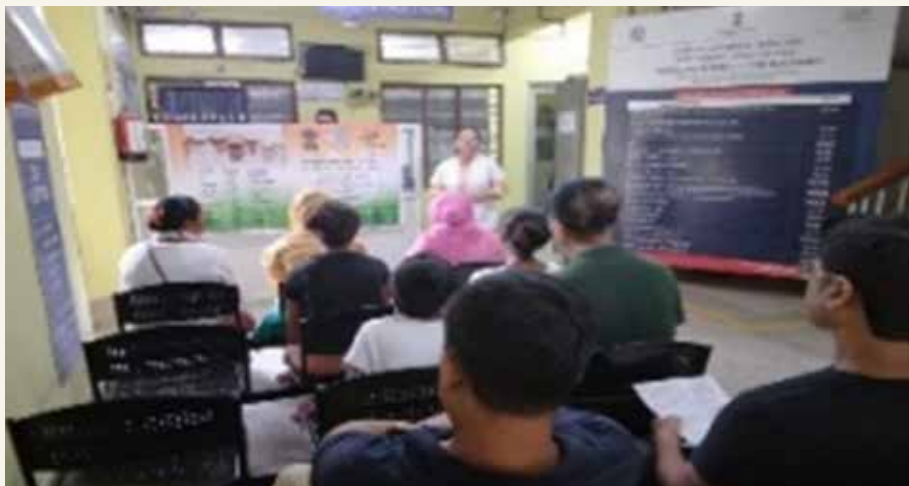
A view of International Year of Millet 2023 at Regional Research Institute for Homoeopathy, Guwahati

Guwahati: International Year of Millet 2023 was organised by Regional Research Institute for Homoeopathy, Guwahati at the institute through different awareness programmes. The awareness programmes were held on 10 th July, 14 th July, 18 th July and 25 th July 2023 at the institute. Number of participants in the programmes were 20, 30, 26 and 22 patients respectively. The topics of discussion were health benefits and nutritional values of Millets. Response of the programme was quite remarkable.