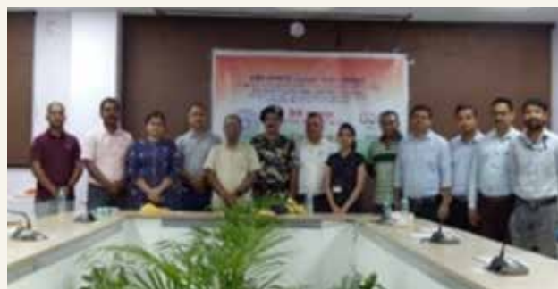
A view of Celebration of Hindi Diwas at Regional Research Institute for Homoeopathy, Siliguri