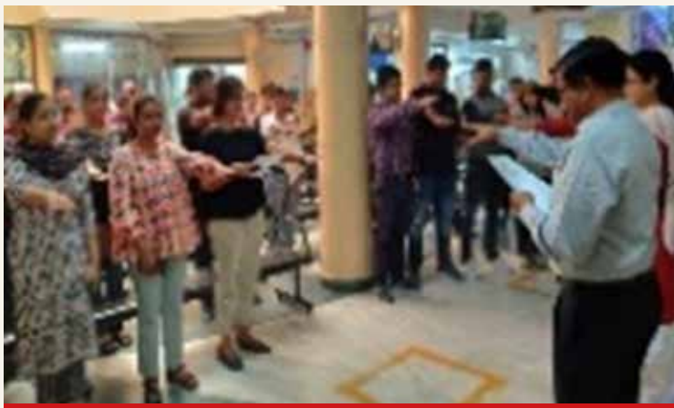
A view of pledge taking ceremony at Dr. D. P. Rastogi Central Research Institute for Homoeopathy, Noida

Noida: The National Sports Day 2023 was celebrated in Dr. D. P. Rastogi Central Research Institute for Homoeopathy, Noida from 21 st to 29 th August 2023 at the institute to foster sports engagement among the staff of the unit and to pay tribute to the eminent Indian hockey player, Major Dhyan Chand. Fit India Fitness Pledge was taken by all staff of the institute on 26 th August 2023. Several outdoor/indoor activities were planned for these days.