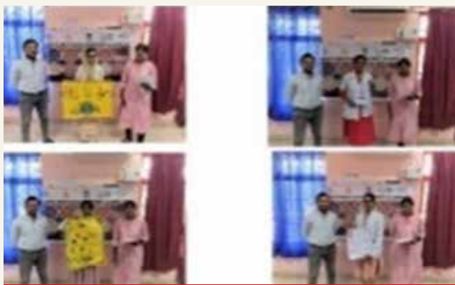
Views of Millet Awareness Posters Competition at HRID, Chennai