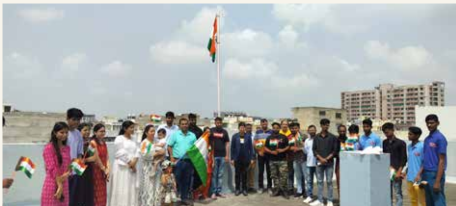
A view of 77 th Independence Day Celebration at CRI(H), Jaipur

Jaipur: On the occasion of 15 th August 2023, Central Research Institute of Homoeopathy, Jaipur celebrated the 77 th Independence Day. After the flag hoisting ceremony, sweets were distributed to all the staff members.