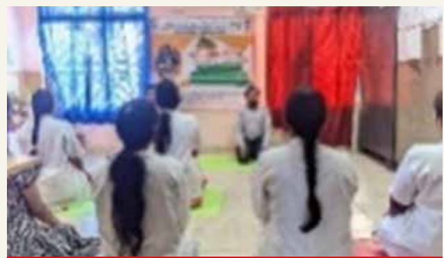
A view of Yoga practical session conducted by HRID, Chennai

Chennai: On 25 th September 2023, Homoeopathy Research Institute for Disabilities, Chennai organized a Yoga awareness program – yoga for health and practical demonstration of various asanas for Wellbeing, as a part of Rashtriya Poshan Maah 2023 celebrations. Total participants were 25.