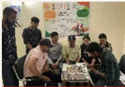
A view of National Sports Day Celebration at Clinical Research Unit (T) for Homoeopathy, Gangtok

Gangtok: Clinical Research Unit (H), Gangtok celebrated National Sports Day 2023 from 21 st to 29 th August 2023 with full enthusiasm and active participation of the staff. The unit started the National Sports Day by taking of the "Fit India" pledge by all the staff at OPD hall. Various sports activities were conducted in the Unit Premises. The National Sports Day celebration was concluded by singing National Anthem of India.