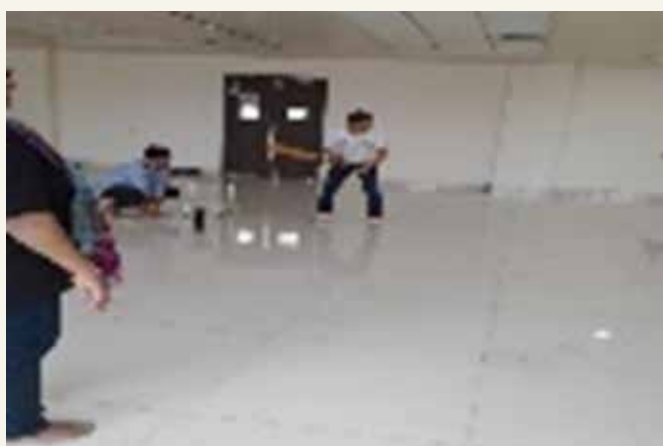
A view of National Sports Day Celebration at Regional Research Institute for Homoeopathy, Navi Mumbai