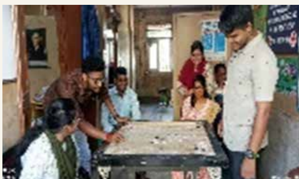
A view of National Sports Day Celebration at Clinical Research Unit(H), Port Blair

Port Blair: Clinical Research Unit(H), Port Blair celebrated National Sports Day on 26 th August 2023. As the part of National Sports Day, all the staff of Clinical Research Unit(H), Port Blair took Fit India Pledge at the Unit and played chess and carrom.