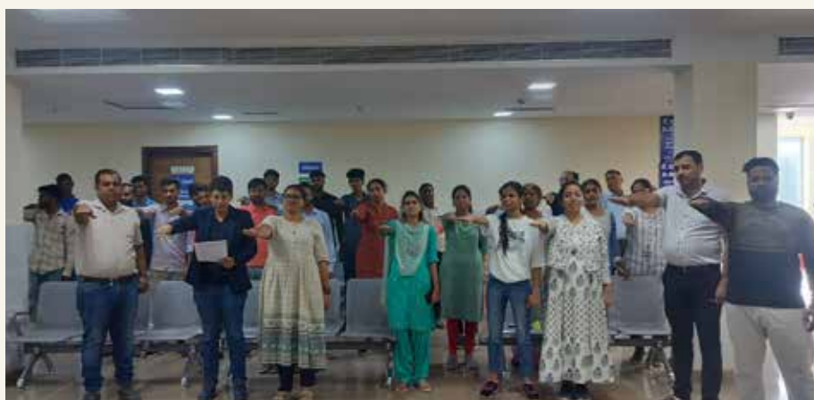
A view of pledge taking ceremony at Central Research Institute for Homoeopathy, Jaipur

Jaipur: A National Sports Day 2023 was celebrated at Central Research Institute for Homoeopathy, Jaipur on 29 th August 2023 by all the officials and staff members and Fit India Pledge was taken on the same day. Several outdoor/indoor fun activities were planned for this day.