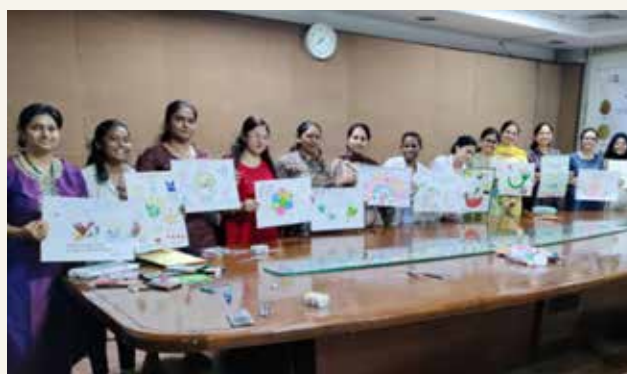
A view of Celebration of international year of Millets 2023: Poster making competition on Millets

Noida: International Year of Millets was celebrated by Dr. D P Rastogi Central Research Institute for Homoeopathy, Noida from 1 st to 30 th September 2023 at the institute. The institute conducted various awareness activities to sensitize the general masses regarding importance of millets for nutrition and motivate the people to include millets in their diet. Meals made from the nutritious cereals were served to the IPD patients at the hospital in the form of roti, khichdi, kheer, porridge etc. under this initiative to promote the use of millets for healthy living. A total of 10 awareness lectures were deliberated in and around the Hospital and outreach camps of villages Salarpur and Roza Yakubpur, Greater Noida. Activities like essay writing competition on Millets, Slogan writing competition and Poster making competition were organized for the staff of the institute.