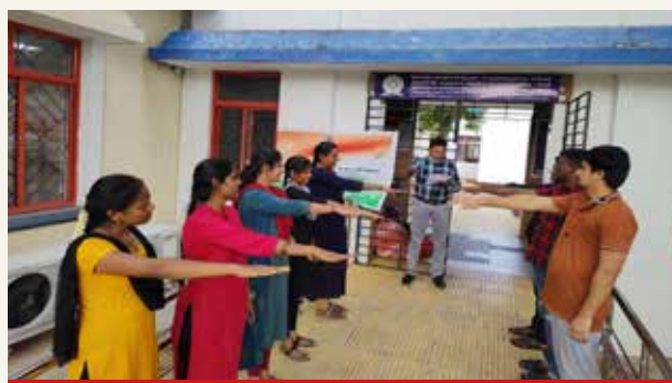
A view of “Meri Maati Mera Desh Campaign” under Azadi Ka Amrit Mahotsav, conducted by HRID, Chennai

Chennai: On 14 th August 2023, as a part of the celebration of the “Meri Maati Mera Desh Campaign” under the Azadi Ka Amrit Mahotsav, all the staff of Homoeopathy Research Institute for Disabilities, Chennai, and Interns of Homoeopathy Medical Colleges, Chennai, took Pancha Pran Pledge with mitti/soil in hand, and taken selfies with the mitti/soil in hand, and uploaded in Meri Maati Mera Desh Campaign website, got their certificates of participation in Meri Maati Mera Desh Campaign. Total Participants were 25.