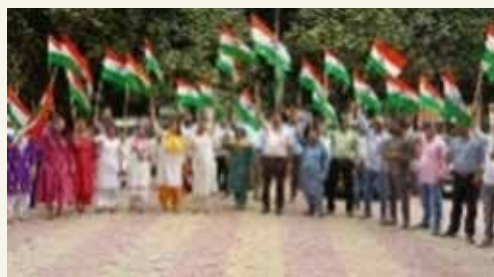
A view of Har Ghar Tiranga Celebration at CCRH Hqrs.