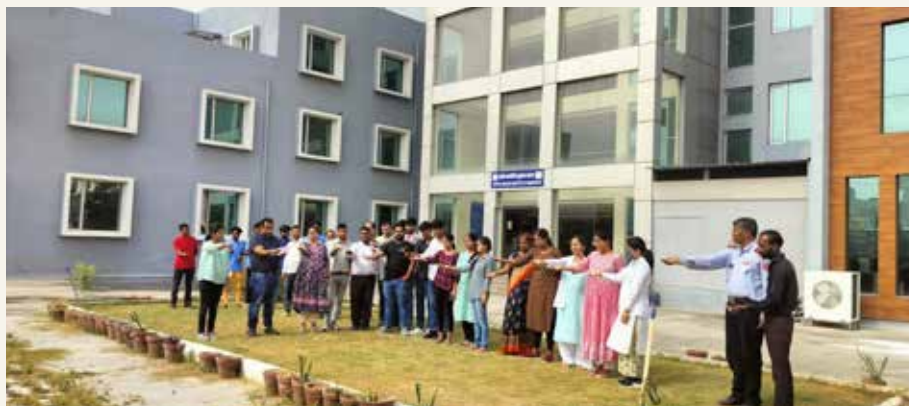
A view of Meri Maati Mera Desh Campaign Celebration at Central Research Institute of Homoeopathy, Jaipur

Jaipur: Meri Maati Mera Desh Campaign under Azadi ka Amrit Mahotsav was Celebrated by Central Research Institute of Homoeopathy, Jaipur at the institute on 26 th August 2023. On 26 th August 2023 all the staff of CRI(H), Jaipur took pledge with holding soil in their hand in the institute premises and thereafter uploaded photo of the same on www.merimaatimeradesh.gov.in and received certificate of appreciation collectively of the staff for taking part in this Programme.