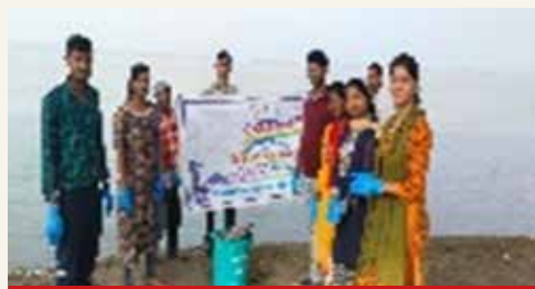
Unit members on "Swachhata Hi Sewa" Cleaning the River bank of Ganga organised by CVU(H), Patna

Patna: Swachhata Hi Sewa Campaign was organised by Clinical Verification Unit(H), Patna on 27 th September 2023 at the unit under the supervision of Officer-Incharge, Dr. K. K. Avinash. Pledge taking ceremony was held on 27 th September 2023 among staff. The activities of cleanliness were performed at different sites like- river bank side; government school. Theme of the campaign was "Garbage free India". People were made aware about the household waste disposal, bio-degradable & non-biodegradable waste and importance of cleaning the surrounding to stay healthy.