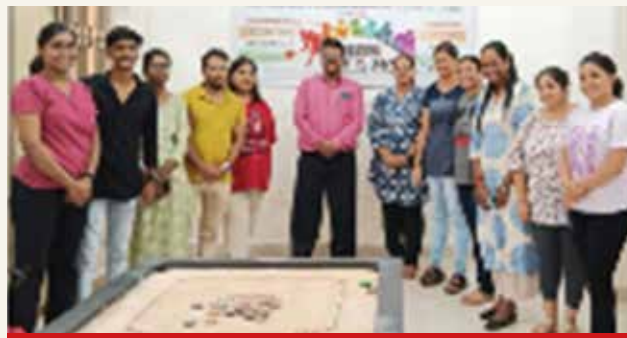
A view of National Sports Day Celebration at Clinical Research Unit (Homoeopathy), Goa