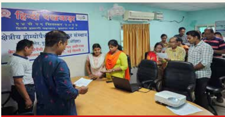
Hindi Divas pledge was taken by the officers and staff of RRI (H), Puri

Puri: On the occasion of Hindi Pakhwada, Hindi Divas pledge was taken by all the officers & staff of Regional Research Institute (H), Puri from 14 th September 2023 to 29 th September 2023. The video message by Director General, CCRH was also played on the occasion of Hindi Divas. Two Hindi competitions on Vad-vivad and Kabita Pathan were conducted among the staff of the Institute on 21 st September 2023. The prize distribution and closing ceremony of the Hindi Pakhwada was conducted on 29 th September 2023.