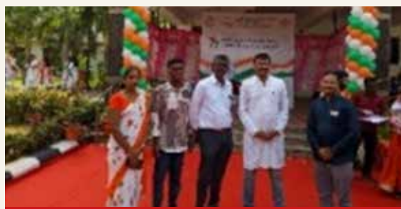
Celebration of Independence Day at NIEPMD, Chennai