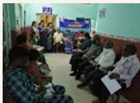
Lecture on "Role of Ayush in Management of Mental Health and Stress" to the OPD patients of RRI(H), Puri

Puri: Awareness to the OPD patients on "Role of Ayush in Management of Mental Health and Stress" was conducted at Regional Research Institute (H), Puri on 10 th July 2023, 19 th July 2023, 25 th July 2023, 26 th July 2023 and 5 th August 2023. Also, it was conducted among the students of Balagandi Govt. High School, Puri on 9 th August 2023.