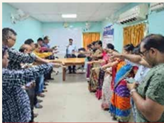
Swachhata Hi Seva pledge taken by all the officers and staff of RRI(H), Puri

Puri: Awareness programme on Swachhata Hi Seva was conducted among the doctors & staff of Regional Research Institute (H), Puri on 27 th September 2023. Swachhata Hi Seva pledge was taken by all the staff of the institute on this day.