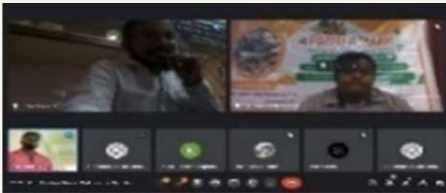
A view of webinar conducted by Homoeopathy Research Institute for Disabilities, Chennai