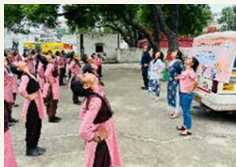
A view of Yoga Camp at Composite School Salarpur