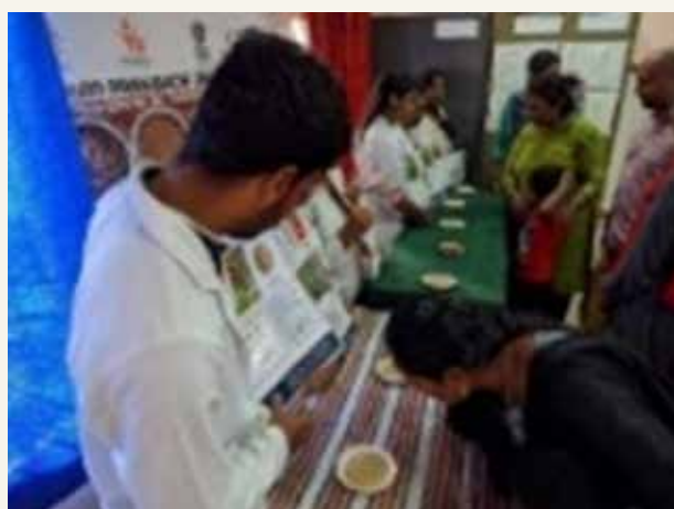
Students, Patients, Staff of HRID, Chennai and NIEPMD, Chennai visiting "Millet Display in their original form" at HRID, Chennai