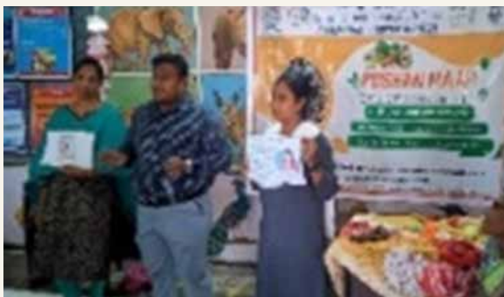
A view of awareness program on "Importance of Breastfeeding And Complementary Feeding" at HRID, Chennai