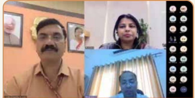
A View of Capacity Building Webinar Series on "Data Modeling with Power BI"