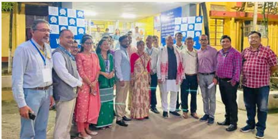
A view of Regional Review Meeting Conducted under National Ayush Mission (NAM) at Guwahati, Assam