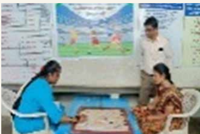
A view of National Sports Day Celebration at Clinical Research Unit(H), Tirupati

Tirupati: The Clinical Research Unit(H), Tirupati celebrated National Sports Day from 22 nd August to 29 th August 2023. As the part of National Sports Day, all the staff members of Clinical Research Unit(H), Tirupati have taken Fit India Pledge at the Unit. Also, all the staff members have taken Fit India Pledge on https://pledge.mygov.in/fitindia/ . On the occasion of National Sports Day, the unit celebrated Indoor Games (Chess, Carroms) and Outdoor Games (Tug of War, Walking, Lemon Spoon and Needle Race) for the staff members.