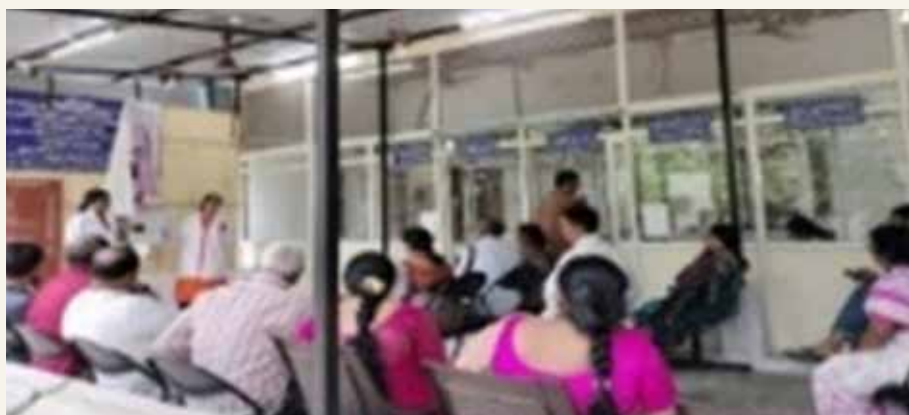
A view of Rashtriya Poshan Maah celebration at Regional Research Institute of Homoeopathy, Hyderabad

Following events were conducted by the institute during the Rashtriya Poshan Maah: from 11 th September 2023 to 16 th September 2023, general sensitization and awareness campaign among the OPD patients, individualized counseling on nutritional home-made millet diet. It was conducted by the doctors of RRI (H), Hyderabad. Total 300 participants were benefitted. On 21 st September 2023, doctors of the institute conducted a lecture for OPD patients with special focus on elderly, women and children to create awareness about “millets and their nutritional benefits for healthy lifestyle” at the institute. Total 151 participants were benefitted. On 23 rd September 2023, doctors launched a campaign in the campus on “Test and Treat Anemia” for all the staff of the institute. All employees were tested for hemoglobin levels and advised for proper treatment and counseling to overcome anemia. Total 27 participants were benefitted. On 29 th September 2023, doctors of the institute launched a campaign on “Talk, Test and Treat Anemia” at the campus for all the OPD patients of the institute. All OPD patients were tested for hemoglobin levels and advised appropriate treatment and counseling to overcome anemia. Total 68 participants were benefitted.