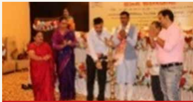
A view of inauguration of Hindi Workshop at Clinical Research Unit (H), Ranchi