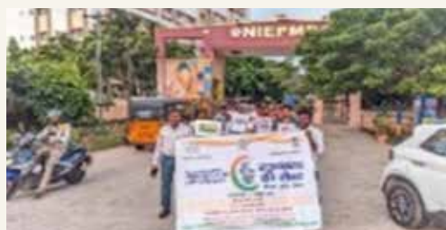
A view of Officers and staffs of HRID, Chennai conducting Swachhata Rally

Clean City, Clean India, Green World; To get a clean and healthy nation - Say NO to open defecation; Let's make the right choice and use dustbin; How to sanitise your hands; Keep nails short and trim them often, avoid biting or chewing nails; and Cleanliness is next to Godliness.