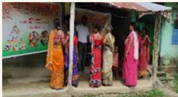
A view of Rashtriya Poshan Maah 2023 Organised by Regional Research Institute for Homoeopathy, Siliguri

On 7 th September 2023 at Pelkujote Primary School, more than 50 personnel were benefitted. On 12 th September 2023 at SCSP Health camp, Kamargachh, Siliguri, more than 52 patients were benefitted. On 13 th September 2023 at RRI(H), Siliguri Conference Room, more than 30 personnel were benefitted. On 14 th September 2023 at RRI(H), Siliguri OPD, more than 123 patients were benefitted. On 18 th September 2023 at RRI(H), Siliguri premises, more than 52 patients were benefitted. On 19 th September 2023 at RRI(H), Siliguri Conference Room, more than 35 personnel were benefitted. On 20 th September 2023 at RRI(H), Siliguri premises, more than 25 patients were benefitted. A tree plantation drive organized at the campus of RRI(H), Siliguri, under Poshan Maah 2023 on 20 th September 2023. On 25 th September 2023 at Poultry farm at Bagdogra, more than 10 population were benefitted. On 26 th September 2023 at SCSP Health camp, Kamargachh, more than 35 patients were benefitted. On 30 th September 2023 at RRI(H), Siliguri premises, more than 51 patients were benefitted. All the campaigns were conducted through different kinds of activities i.e. Healthy dietary practices and