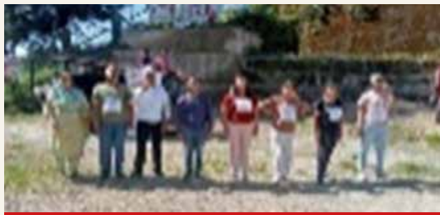
A view of National Sports Day Celebration at Regional Research Institute for Homoeopathy, Shimla

of Regional Research Institute for Homoeopathy, Shimla to promote the significance of fitness and discussed topics such as Nutrition, Exercise Routines, and Maintaining a Healthy lifestyle. At the end, the Prize Distribution Ceremony was done, and all the winners & outstanding participants were presented with certificates and recognition, celebrating their remarkable achievements.