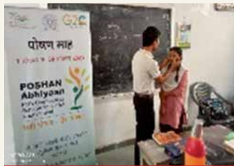
A view of Talk, test and treat anemia campaign at Primary school Salarpur

A webinar was organized for college students on the theme “Role of Ayush to address anemia’ with speakers from different streams of Ayush namely Homoeopathy, Ayurveda, Yoga & Naturopathy. A talk, test and treat anemia campaign was also conducted at Primary school Salarpur where students were examined for signs of anemia along with homoeopathic consultation. Around 2660 patients visited the institute and 289 students were benefitted under the program.