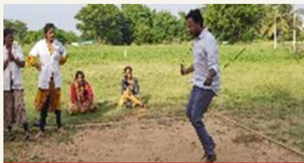
A view of National Sports Day Celebration at Homoeopathy Research Institute for Disabilities, Chennai

Chennai: Homoeopathy Research Institute for Disabilities, Chennai celebrated National Sports Day on 24 th August 2023 by conducting various Indoor, Outdoor, and Fun activities at the institute. The participants of both the teams took the Fit India Pledge and got their certificates.