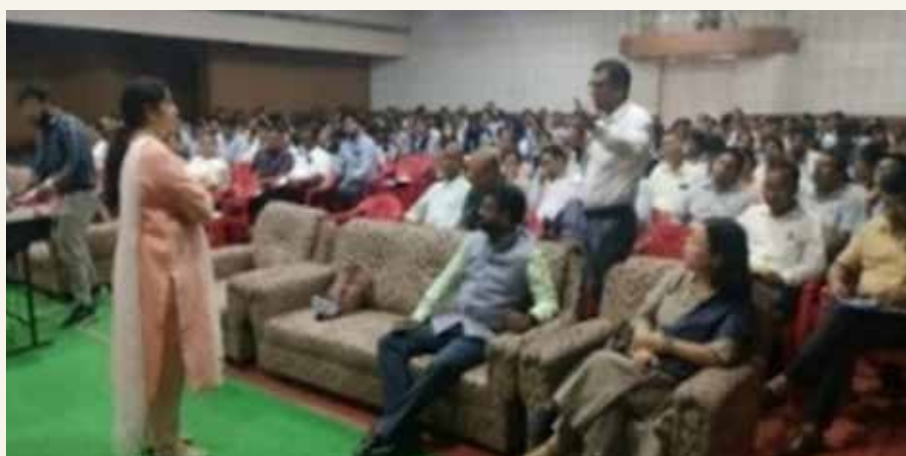
A view of 'Training Cum Orientation Program for Drug Proving Research and Awareness about the HPT Portal of CCRH'