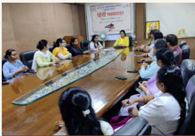
Celebration of Hindi Pakhwada at DDPRI(H), Noida

Noida: Hindi Pakhwada was celebrated by Dr. D P Rastogi Central Research Institute for Homoeopathy, Noida from 14 th September to 30 th September 2023 at the institute. The theme of the Hindi Pakhwada was to promote awareness of the use of Hindi language among the staff of the institute and to make it the primary language for use in official work. In order to promote the objective of Hindi Pakhwada, various awareness activities and competitions were conducted at the institute such as Hindi essay competition, Hindi debate competition, Hindi shrutlekh competition and Hindi translation competition and winners were awarded with certificates.