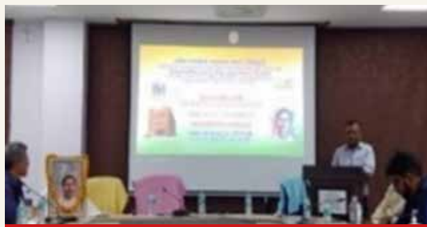
A view of Celebration of Munshi Premchand Jayanti at Regional Research Institute for Homoeopathy, Siliguri