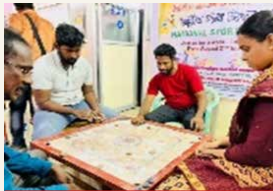
A view of National Sports Day Celebration at Clinical Research Unit for Homoeopathy, Puducherry

Puducherry: Clinical Research Unit for Homoeopathy, Puducherry celebrated National Sports Day 2023 on the theme "Sports are an enabler to an inclusive and fit society" as a part of a week-long celebration from 21 st to 29 th August 2023 and tribute to the eminent Indian hockey player, Major Dhyan Chand on August 28, 2023. As a part of the event, the Fit India Pledge (physical as well as E- Pledge) was taken by the Officer and staff of CRU (H), Puducherry. Various sports activities were conducted in the Unit Premises.