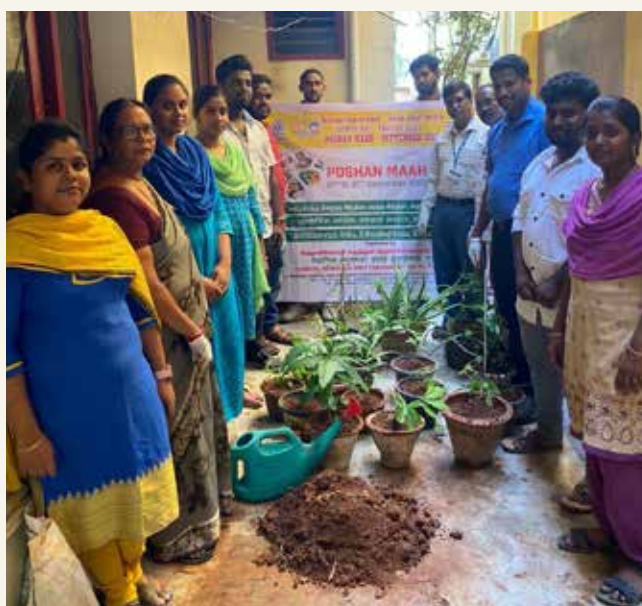
Officer and Staff of CRU(H), Puducherry actively participating in the plantation drive as a part of ‘Rashtriya Poshan Maah’ celebration at CRU(H), Puducherry

Puducherry: As a part of Rashtriya Poshan Maah 2023, from July 2023 to September 2023 Clinical Research Unit (H), Puducherry organised awareness lectures on ‘Role of Millets in prevention/management of ‘life style diseases’, Anaemia and its general preventive measures and role of Millets in particular to OPD patients and bystanders at the institute and at SCSP camp OPD located at Pitchaveeranpet, Sakthi Nagar and Sathya Nagar of Puducherry and ‘Poshan Vatika’. A plantation drive focusing on Medicinal plants, was also carried out by CRU (H), Puducherry, as a part of the “Rashtriya Poshan Maah 2023” celebration.