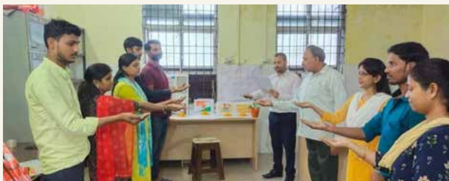
A view of Pledge taken on Meri Maati Mera Desh at CVU(H), Patna