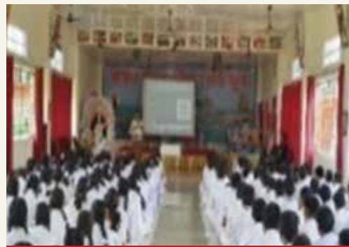
A view of Awareness Campaigns on International Year of Millets 2023 Conducted by Regional Research Institute for Homoeopathy, Siliguri

On 31 st August 2023 at Pelkujote Malnutrition Camp, Siliguri, more than 40 patients were benefitted. On 7 th September 2023 at Pelkujote Primary School, more than 50 personnel were benefitted. On 12 th September 2023 at SCSP Health camp, Kamargachh, Siliguri, more than 52 patients were benefitted. On 13 th September 2023 at RRI(H), Siliguri Conference Room, more than 30 personnel were benefitted. On 14 th September 2023 at RRI(H), Siliguri OPD, more than 123 patients were benefitted. On 18 th September 2023 at RRI(H), Siliguri premises, more than 52 patients were benefitted. On 19 th September 2023 at RRI(H), Siliguri Conference Room, more than 35 personnel were benefitted. On 20 th September 2023 at RRI(H), Siliguri premises, more than 25 patients were benefitted. On 25 th September 2023 at Poultry farm at Bagdogra, more than 10 population were benefitted. On 26 th September 2023 at SCSP Health camp, Kamarhachh, more than 35 patients were benefitted. On 30 th September 2023 at RRI(H), Siliguri premises, more than 51 patients were benefitted.