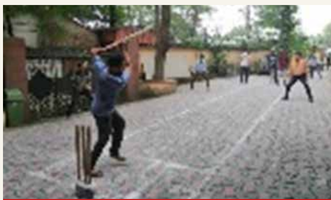
A view of National Sports Day Celebration at Dr. Anjali Chatterjee Regional Research Institute for Homoeopathy, Kolkata