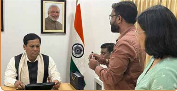
A View of Review Meeting Conducted by Shri Sarbananda Sonowal, Hon'ble Cabinet Minister, Ministry of Ayush & Ministry of Ports, Shipping and Waterways at his Residence, Guwahati