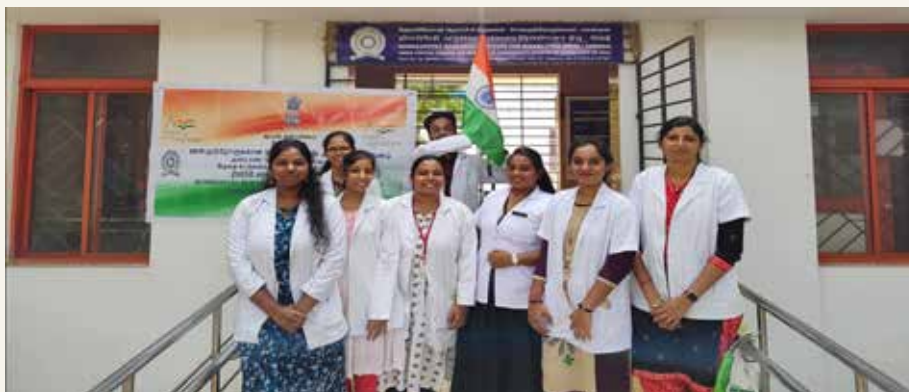
“Har Ghar Tiranga Campaign” under Azadi Ka Amrit Mahotsav, conducted by HRID, Chennai

Homoeopathy Medical Colleges, Chennai, hoisted the Indian flag at their home as well at the institute, took selfies with the flag and uploaded in Har Ghar Tiranga website and got their certificates of participation in Har Ghar Tiranga campaign. Total Participants were 25.