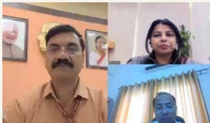
A view of Capacity Building Webinar Series on "Data Modeling with Power BI"

The webinar was successful in enhancing the capacity building of all the participants with important discussions in software on data science, and artificial intelligence and the sharing of experiences and perspectives of the learned speakers. The overwhelming response of the participants encouraged the Webinar Division to organize more such webinars in future.