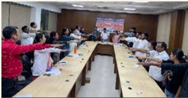
Pledge taken on Hindi Pakhwada at CRI(H), Jaipur

Jaipur: Hindi Pakhwada was organized by Central Research Institute of Homoeopathy, Jaipur from 14 th September 2023 to 29 th September 2023 at the institute. Pledge was taken to motivate others to do the regular office work in Hindi followed by organization of various competitions like essay writing, poem recitation in the seminar hall of the institute. All the staff of the institute participated in the competitions. The closing ceremony of the pakhwada took place on 29 th September 2023 with provision of lunch to all the staff of CRI(H), Jaipur.