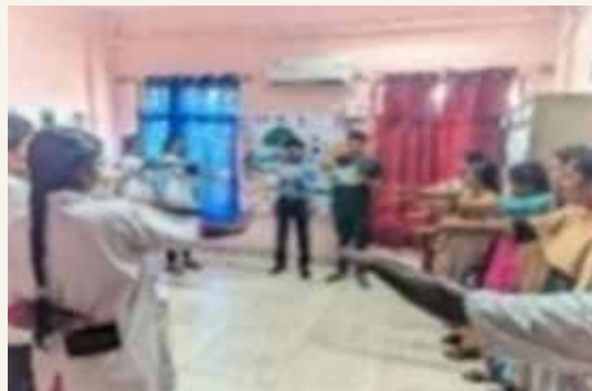
A view of Swachhata Shapath pledge taken by officers and staff of HRID, Chennai at the institute

Chennai: On 26 th September 2023, as a part of Swachhata Hi Seva campaign 2023, the Homoeopathy Research Institute for Disabilities, Chennai, conducted "Swachhata Shapath" program at the institute. Swachhata Shapath pledge taken by officers and staff of HRID, Chennai at the institute.