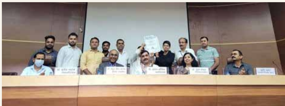
A view of NABH AYUSH Entry-level certification of Central Research Institute (H), Jaipur