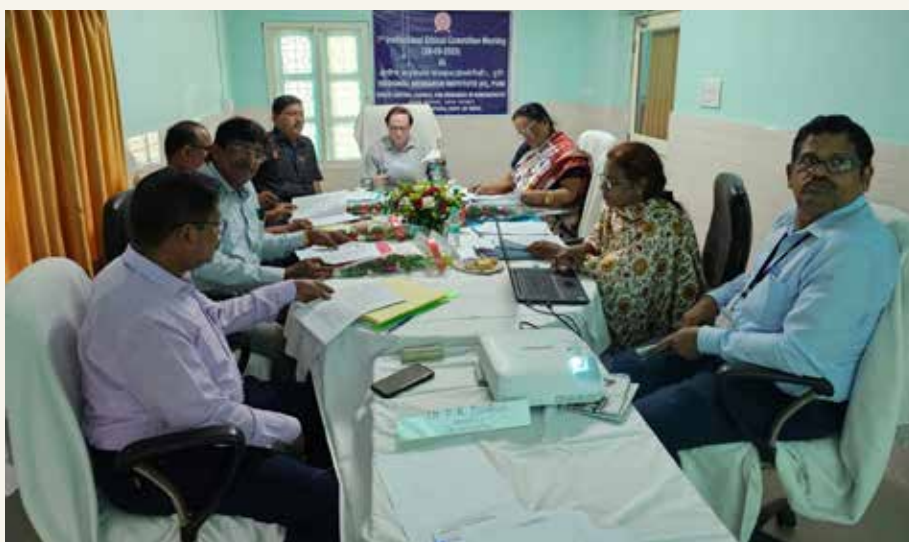
A view of 1 st IEC meeting of RRI (H), Puri