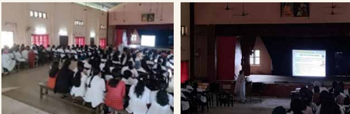
Views of Workshop on Orientation Cum Training on Council's Drug Proving Protocol and HPT Portal at NHRIMH, Kottayam

The Proving Associate informed that the college has been participating in the research project for almost 15 years and assured that this association will continue, and sincere efforts shall be made to provide the best outcome.