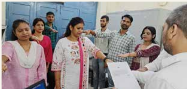
A glimpse of Pledge taking on occasion of Hindi Diwas at CVU(H), Patna